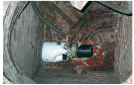
Pressure pots close the steam system