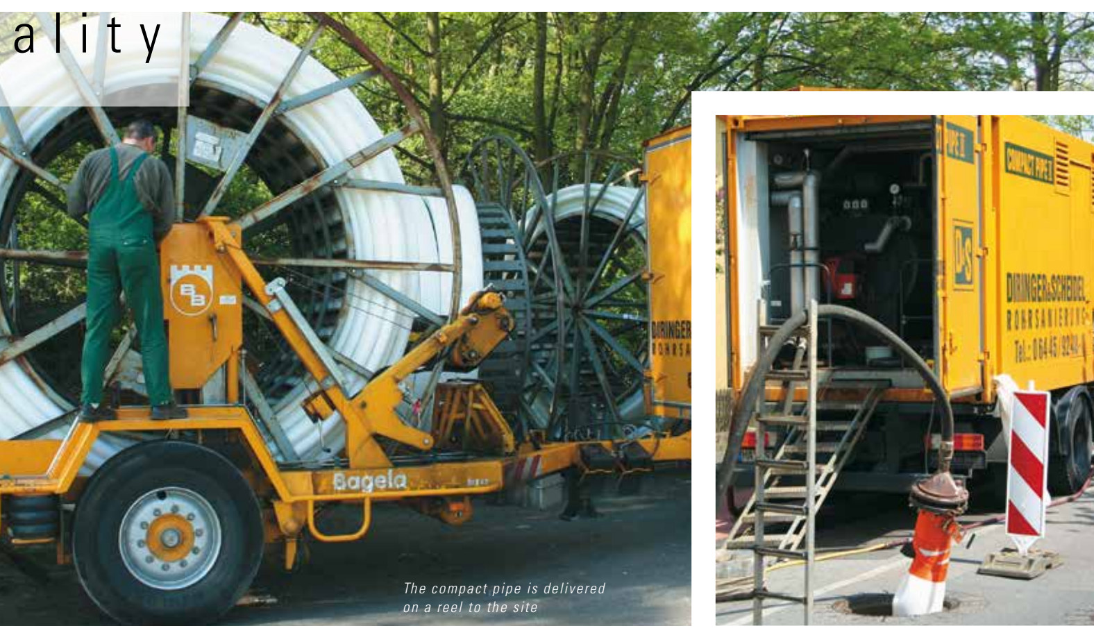
Boiler plant with steam