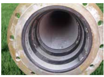
Liner end collar for the connection with the flange mounted before the installation in case of large pipe dimensions