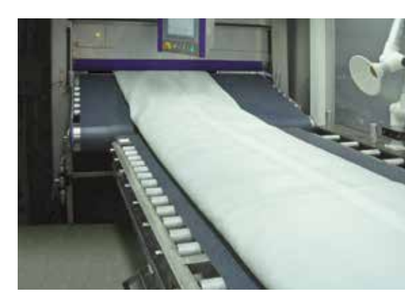
On-site impregnation with the epoxy resin MaxPox®