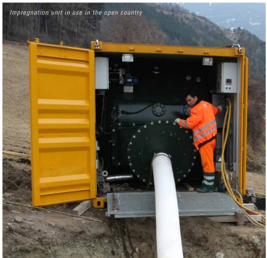
Impregnation unit in use in the open country

The BlueLine procedure has been developed for the trenchless rehabilitation of pressure pipelines for drinking water. Thanks to the pipe-in-pipe system this rehabilitation procedure does not depend on the old pipe. The structure is self-supporting, i.e., it can bear all occurring static external and internal load without any support of the old pipe. Usually the field of application covers nominal widths from DN 100 to DN 1000 with different installation lengths up to 200 m and more, with a wall thickness of 5 to 21 mm depending on the static requirement.