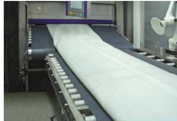
On-site impregnation with the epoxy resin MaxPox®