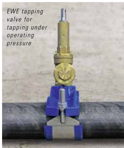
EWE tapping valve for tapping under operating pressure

The preparation of the BlueLiner is provided in the mobile impregnation unit, the components of which are optimally adapted to the procedure. The SPC-controlled, fully-automatic mixing unit works as a closed system. The resin and hardener tanks have a volume of 3,000 kg and are fully air-conditioned. Thus the resin temperature can be kept constant irrespective of the outer influences. Defined quantities of resin and hardener are transported via an adjustable conveyor pump to the compulsory mixer, merged at the exclusion of air, then fed into the liner under vacuum and finally calibrated. All data relevant to the system are continuously documented and controlled by electronic measuring devices integrated by the system manufacturer.