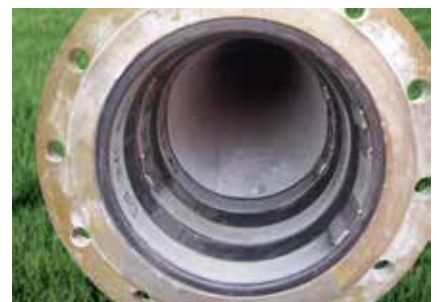
Liner end collar for the connection with the flange mounted before the installation in case of large pipe dimensions