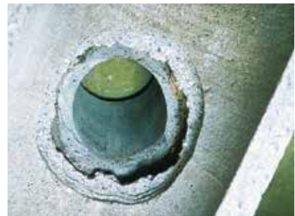
Pre-milled socket before the KA-TE rehabilitation

of the line segment. The sheathing collar is removed as soon as the filled-in epoxy resin has cured. A subsequent treatment of the connection area is not necessary. An adequate preparation of the damaged spots is of utmost importance for the result of the rehabilitation work. During the first work step the prepared surface is carefully milled out with the milling robot and grease contaminants, loose parts, etc. are completely eliminated. Then the sheathing collar is positioned by the filler robot over the inlet and a balloon, having the function of an internal sheathing, is placed in the inlet. A lock makes sure that the collar is tight in the defined position. The epoxy resin is then pressed through two openings into the inlet to be rehabilitated. After the curing the filler robot picks up the collar and the balloon sheathing. The result is an inlet with a smooth surface, completely backfilled and without any cross-sectional reduction in the branch connection area.