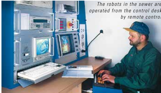
The robots in the sewer are operated from the control desk by remote control