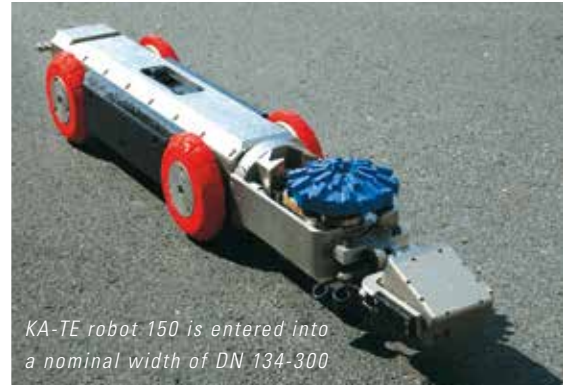
KA-TE robot 150 is entered into a nominal width of DN 134-300