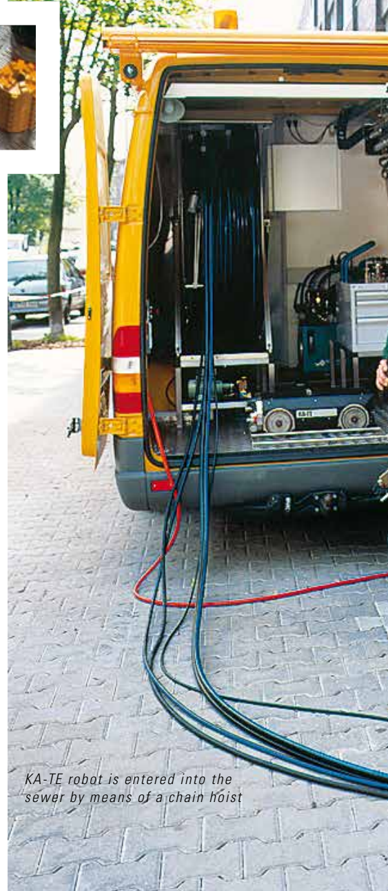
KA-TE robot is entered into the sewer by means of a chain hoist