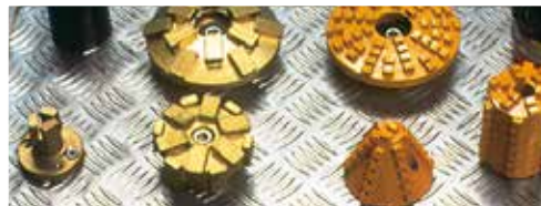
Diamond and carbide milling heads

KA-TE robots come into operation in pipelines of any common material in a nominal diameter range from DN 150 to DN 800. Additional equipment allows the cruising in egg-shaped profiles. The fields of application comprise protruding, broken, recessed inlets or inlets to be closed, axial and