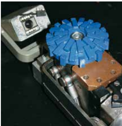
Milling robot DN 150 with panorama camera

The name "KA-TE" stands for the professional rehabilitation of sewer systems. DIRINGER & SCHEIDEL ROHR-SANIERUNG has been utilising this high-tech product for more than 20 years and is the major user worldwide because of the large number of robots in operation.